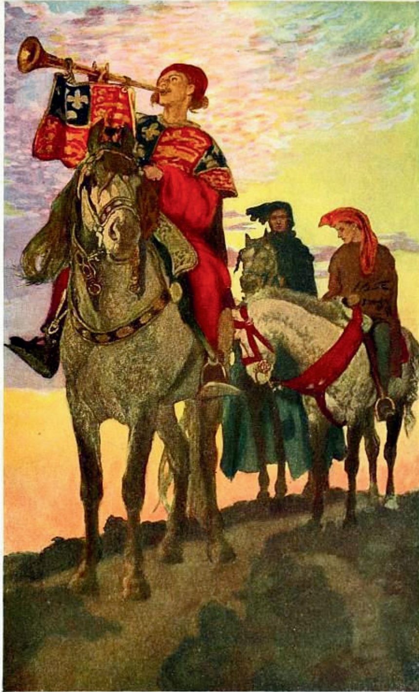
THE HERALD ONCE MORE SET THE TRUMPET TO HIS LIPS AND BLEW