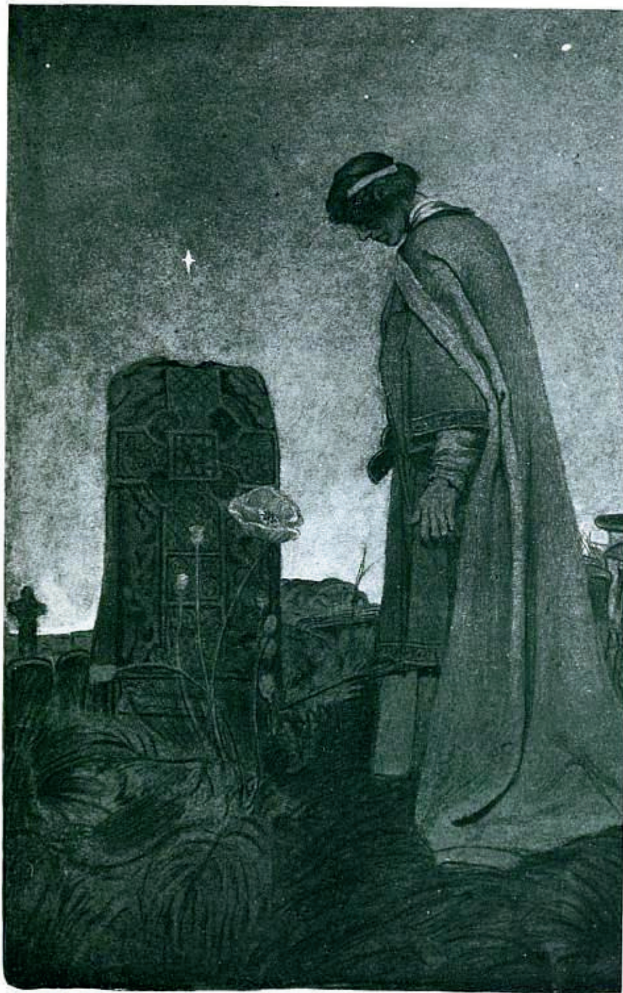
HE WENT FORTH INTO THE DAWN SLEEPLESS