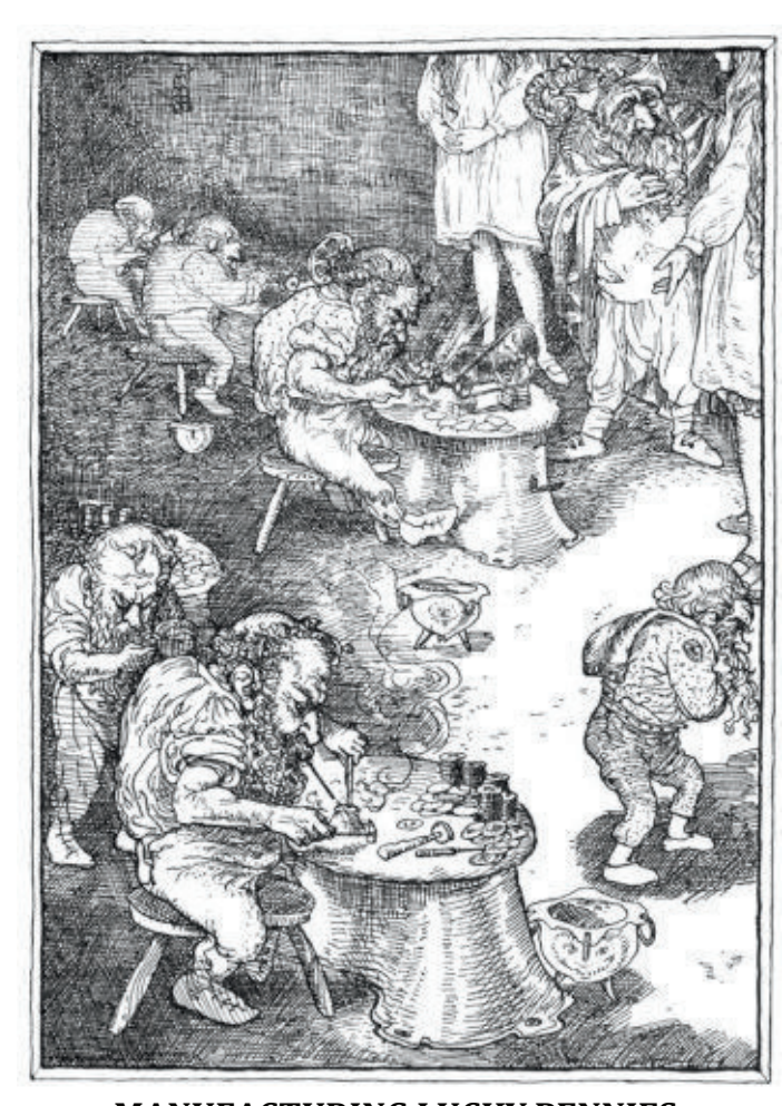
MANUFACTURING LUCKY PENNIES.

The guide-gnome signed to the children to come close up to one little earth-man and watch what he was doing.