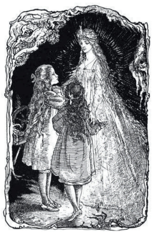
"I MUST GIVE YOU ONE OR TWO WARNINGS."

'But still,' said the lady, though she smiled, 'I must give you one or two warnings. Gnomes are gnomes, remember—not angels, not even fairies. They are queertempered folk. In speaking to them you must be very respectful and never interrupt them. And you must never seem to pity them in the very least; they think their underground country is far more wonderful and delightful than any other, and you must not disagree with this opinion.'