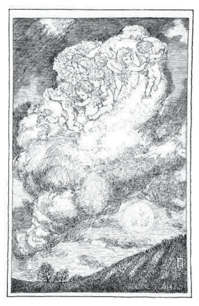
"WHO SENT YOU TO KISS US, YOU BREEZES OF MAY?"