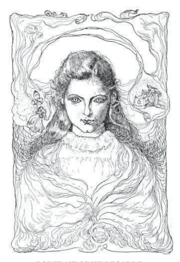
PORTRAIT OF HILDEGARDE.