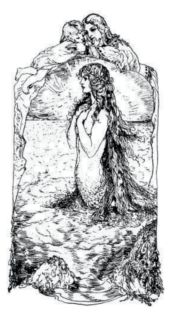
THE UNSELFISH MERMAID.